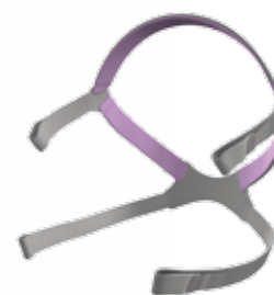
AirFit N10 for Her headgear 63261 (S)