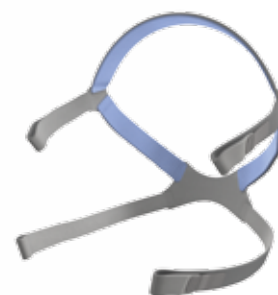
AirFit N10 headgear 63262 (S) 63260 (Std)